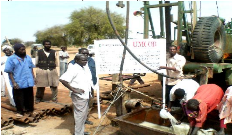
Figure 1: Borehole development in El Dereiga Village